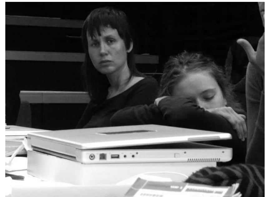
EXPEDITION: Amsterdam §

(beds, blankets, calmness teas), sleep soundtracks, etc. or the invisible type (performance blending finely into social dynamics).../ different places (better near heaters, see also sleep safety, pets, feng shui...)